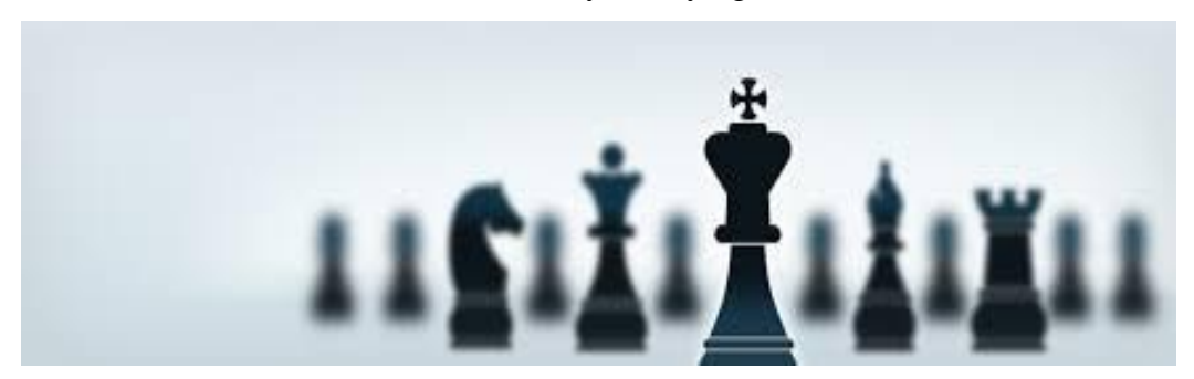
Figure 4. The act of headship

Risk oriented thinking: The person must have strong knowledge and culture the improvements of actions. He can sustain in the world by satisfying their clients.