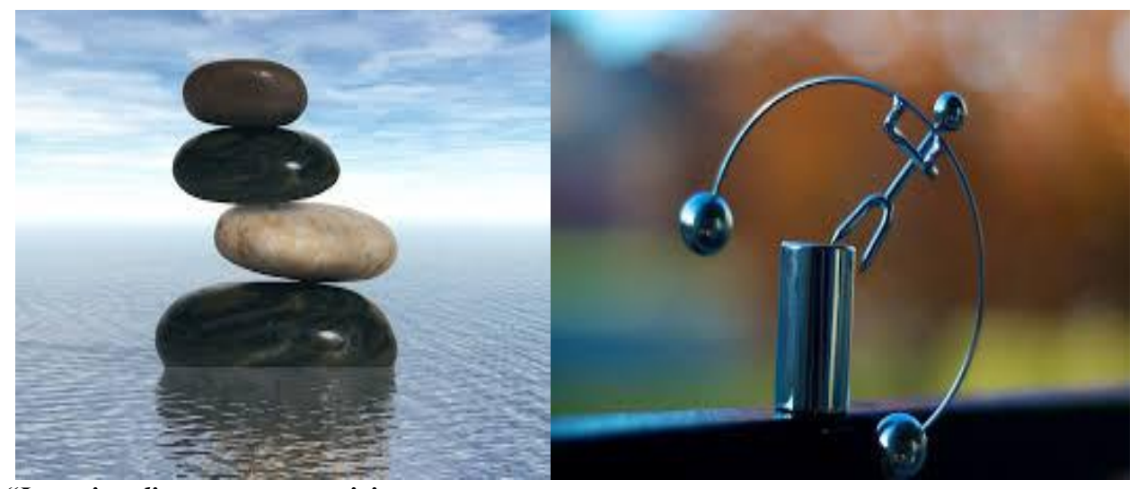
"Learning direct you to creativity Creativity leads you to good thinking Thinking provides you better Knowledge And always Knowledge makes you great."